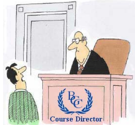
I had no idea that not repairing divots was such a serious offense !!

The divots appear to be getting worse on the course, especially at the corner on the 11 th , which is a disgrace. Taking care of the golf course is your responsibility while you are playing a round of golf. What you do or don't do will greatly affect the players immediately behind you, as well as the membership as a whole. The golf course is a living